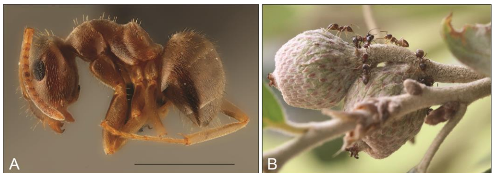
Figure 1. Lasius neglectus from Izola, Slovenia. A – Worker, lateral view (scale bar = 1 mm), B – L. neglectus workers tending aphids on Quercus ilex in Izola park.

ant species invading the European territory is Lasius neglectus Van Loon et al., 1990 (Fig. 1A). This species, probably originating from Asia Minor (Seifert 2000), was described from Budapest, Hungary (Van Loon et al. 1990), and is now reported from 16 European countries (Espadaler & Bernal 2018). Here it is mostly found in human-modified habitats, ranging from purely urban habitats (e.g. in streets with heavy traffic) to city gardens, urban woods and semi-urban areas (Espadaler & Bernal 2018). It is reported on its negative effects on native arthropod fauna (Nagy et al. 2009). Less is known about Tapinoma magnum Mayr, 1861 (Fig. 2A). This species, previously also known under the name T. nigerrimum , is distributed in the Mediterranean area from NW Africa to Italy and is particularly abundant in open unstable or degraded areas with anthropogenic influence and a weakly developed tree layer (Seifert et al. 2017). Recently, it was reported to be artificially introduced to several cities in Germany, Belgium and the Netherlands, where it established permanent supercolonies and acts as a pest species with strong local impacts (Dekoninck et al. 2015, Noordijk 2016, Seifert et al. 2017). It shows the strongest invasive potential of all species of T. nigerrimum complex (Seifert et al. 2017).